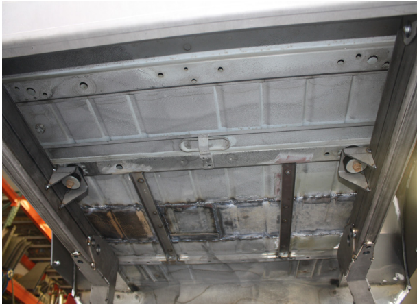
A view from the underside showing the reattached body mounts.